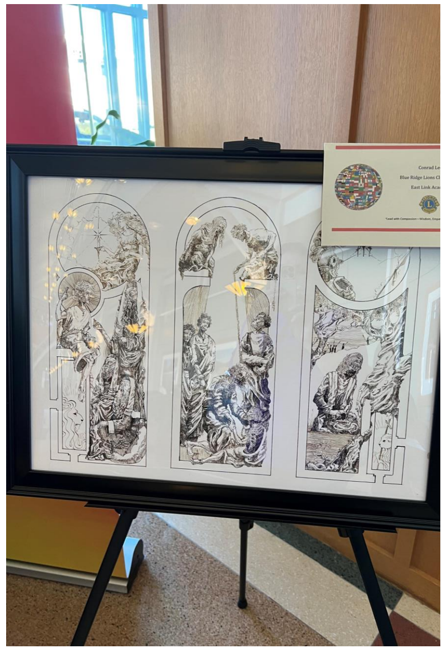
Peace Poster Display Greer Memorial Hospital Lobby