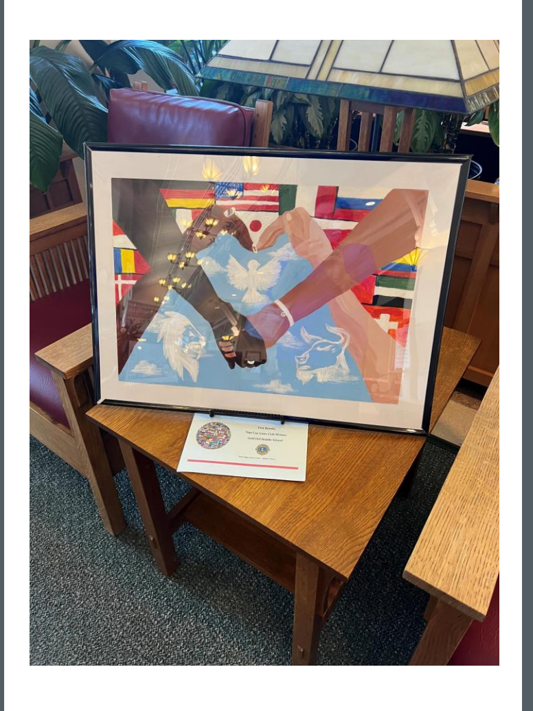
Peace Poster Display and Reception Greer Memorial Hospital