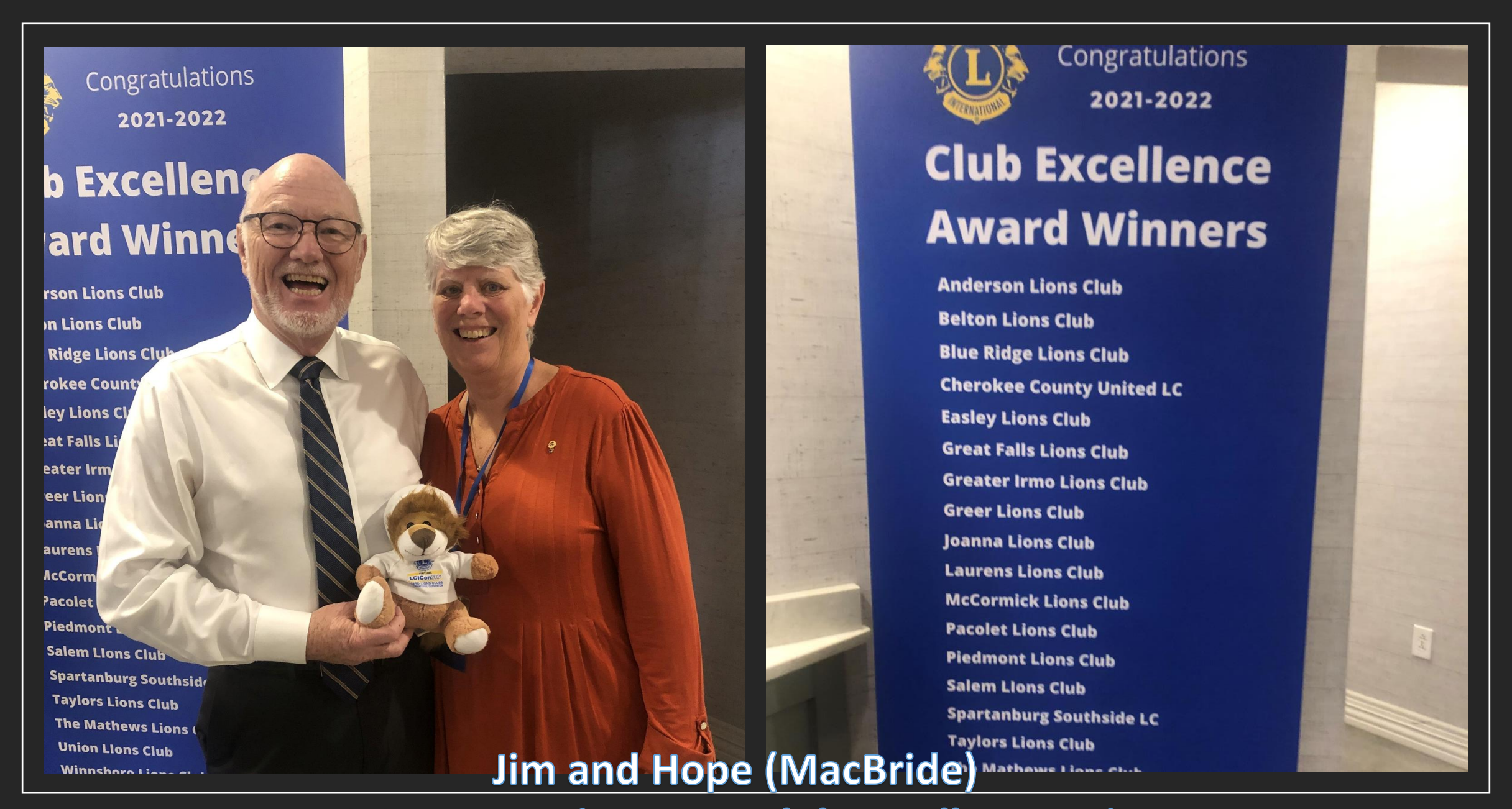
BRLC 6 consecutive years Club Excellence Winner